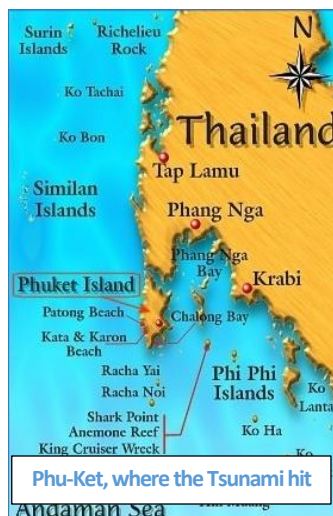
Phu-Ket, where the Tsunami hit