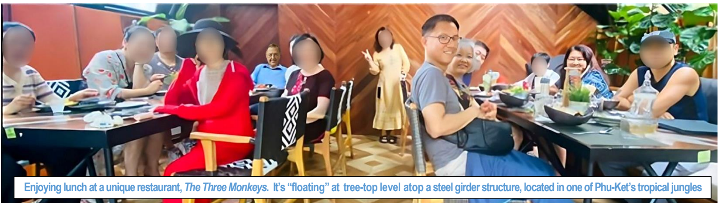
Enjoying lunch at a unique restaurant, The Three Monkeys . It's "floating" at tree-top level atop a steel girder structure, located in one of Phu-Ket's tropical jungles